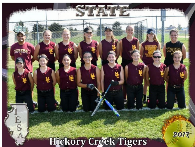
Hickory Creek Tigers

PARENTS: Pictures are taken of your team before their first game. Pre-order this week from your photo coordinator and leave Friday with your STATE SOUVENIR PHOTO PLAQUE.